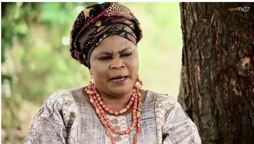
Oko asewo latest yoruba movie. Latest nigerian yoruba movies 2021.